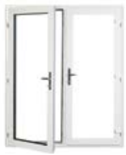
Fully opening French door (hinges on the sides and astragal)