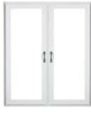
Terrace door with central mullion (option of hinges on the exterior walls or on the mullion)